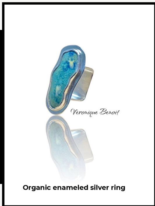
Organic enameled silver ring