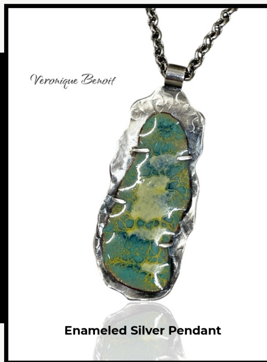
Enameled Silver Pendant